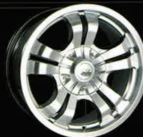
VALOUR (S027) 17x8