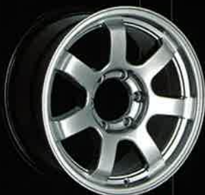
CARIBBEAN (S080) 17x8