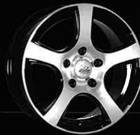
TORQUE (S016) 13x5.5, 14x6, 15x6.5