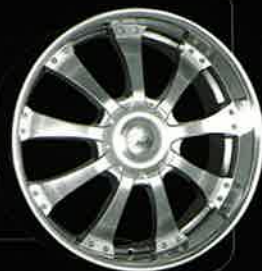
INFINITUM (S018A) 17x8, 18x8.5 20x9, 22x10 SCL