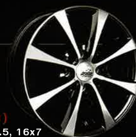
FROST (S021) 14x5, 14x6, 15x6.5, 16x7