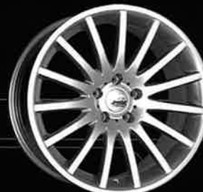
MIST (S054) 18x8