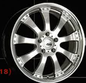
INFINITUM (S018) 17x7.5, 18x8 19x8, 20x8.5