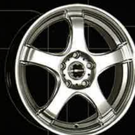
STAR (S039) 15x6.5, 16x7, 17x7, 18x7.5 SGL