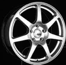
ETERNITY (S007) 15x6.5, 16x7, 17x7