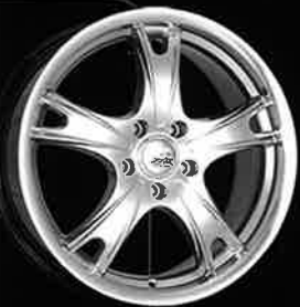
VIRUS (S047) 17x7.5, 18x7.5