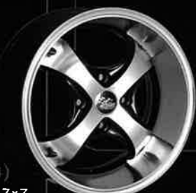
SABRE (S074) 16x7, 16x8, 17x7