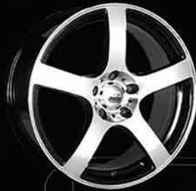
TREX (S013) 15x6.5, 16x7, 17x7, 18x8