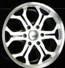
HURRICANE (S037) 18x8.5, 20x9