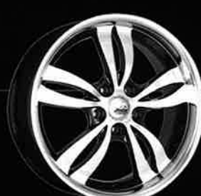
SINARA (S043) 17x7.5, 18x8 SBL