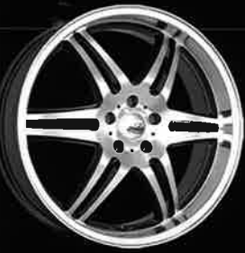
ECLIPSE (S012) 19x8, 20x7.5