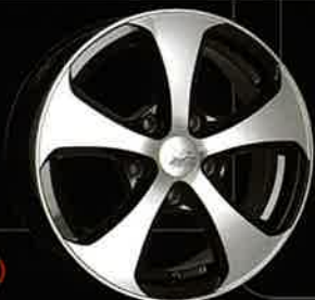
SURGE (S056) 14x6, 15x6.5