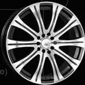
NIRVANA (S030) 15x6.5, 16x7 17x7, 18x7.5