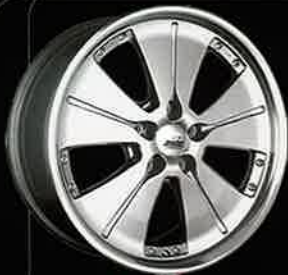
BLAZE (S001) 17x7.5, 18x8