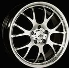
INFERNO (S003) 17x7.5