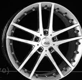
MAJESTIC (S070) 17x7, 18x7.5