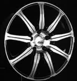
ZENITH (S017) 17x7