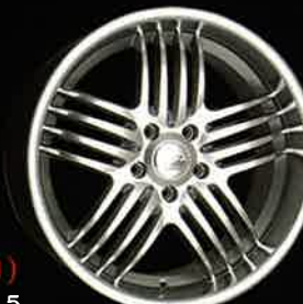
ALPHA (S061) 19x8.5, 19x9.5