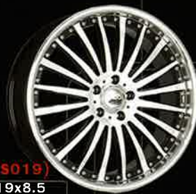
MULTYSPOKE (S019) 17x7.5, 18x8, 19x8.5 19x9.5, 20x8.5, 20x9.5, 22x8.5, 22x9.5 SGL