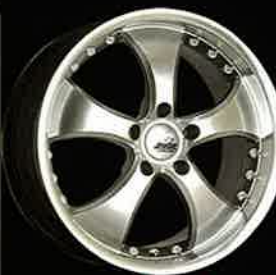
RAZE (S004) 17x7.5, 18x8