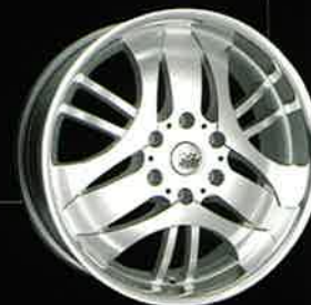
SENATO II (S063) 20x8.5 SCL