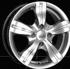
SLAY (S031) 14x5.5