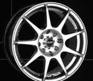
NANO (S055) 14x5, 14x5.5, 15x6, 15x6.5