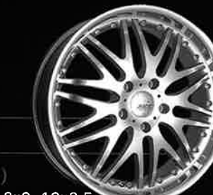
RAPTOR (S075) 17x7.5, 18x8, 18x9, 19x8.5 19x9.5, 20x8.5, 20x9.5, 22x8.5, 22x9.5