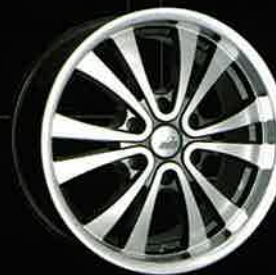
HORNET (S058) 15x7.5, 18x8.5