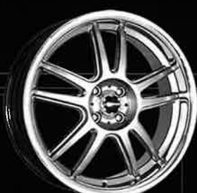
TWIN (S042) 15x6.5, 16x7, 17x7, 18x7.5 SBL