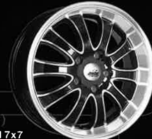
SPHERE (S032) 15x6.5, 16x7, 17x7