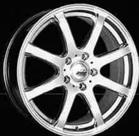
HASTE (S010) 15x6.5, 16x7, 17x7