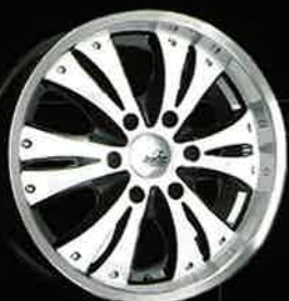
XENA (S036) 18x8.5, 20x9