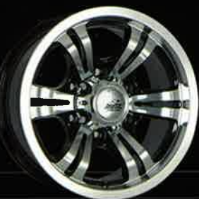
TRITON (S015) 15x8, 16x8