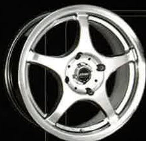
PHAZE (S033) 15x6.5