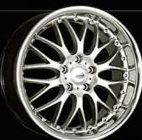
MESH (S038) 17x7.5, 18x8, 18x9 19x8.5, 19x9.5, 19x10.5 SGL