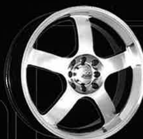
COSMO (S011) 15x6.5, 16x7, 17x7