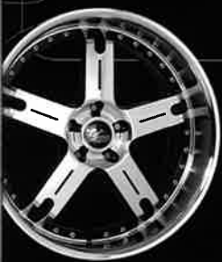
IMAGINE (S066) 17x7.5, 18x8, 19x8.5 19x9.5, 20x8.5, 20x9.5, 20x10.5 SBL