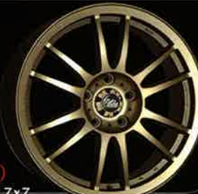
STING II (S057) 15x6.5, 16x7, 17x7