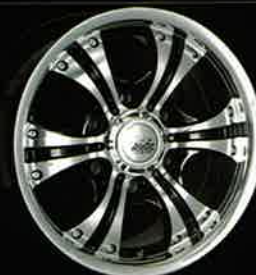
STORM (S035) 15x7.5, 17x7.5