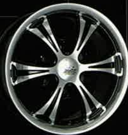
SPIKE (S053) 15x7.5