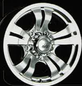
CYCLONE (S014) 14x6, 15x8, 16x8