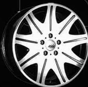
SPEED (S048) 17x7, 18x7.5, 18x8 18x9, 19x8, 19x9