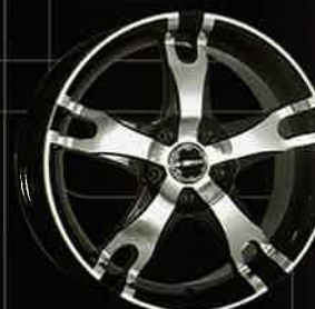
CINCO (S040) 15x6.5, 16x7