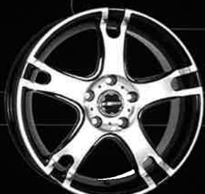
HULK (S041) 15x6.5, 16x7, 17x7, 18x7.5