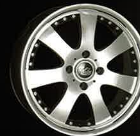
FLASH II (S005) 17x7.5, 18x7.5